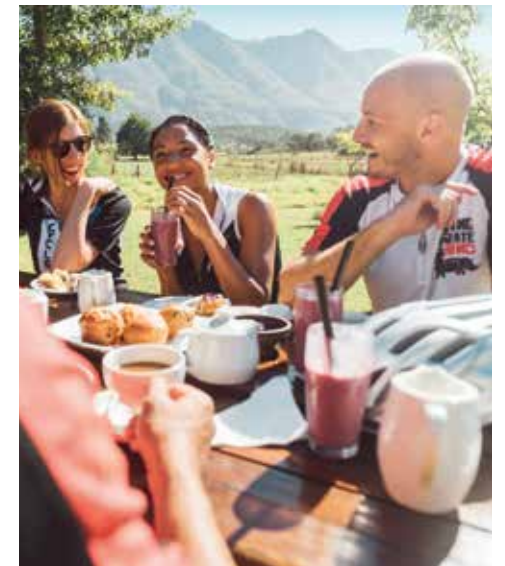
Wildevraam Berry Farm

Riding through the heart of the Cape Winelands signals the final stretch of the route. This section is all tar, but very worth it, as you wind your way past some of the country's most superb and well known wine farms. Push over the Helshoogte Pass – the final pass of the ride - and coast down to Stellenbosch for a photo finish, and a well-deserved beverage, at your final destination.