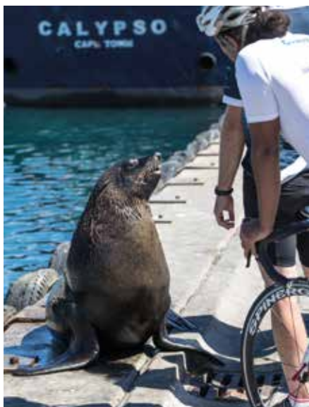
Hout Bay Harbour

The infamous Suikerbossie climb out of Hout Bay is quite busy, but has a good wide shoulder. The exclusive beach suburb of Llandudno offers up a panoramic ocean view. It is complemented by the sight of Lion's Head and the back of Table Mountain as you continue on towards Camps Bay. The vibrancy of city life is evident as you pass the beaches and eateries and private balconies of this Riviera-like part of Cape Town. As you reach Sea Point it is a good idea to slow down and meander along the bike path along the promenade. It will guide you past the Mouille Point lighthouse and back to the well signposted V&A Waterfront, where your journey ends.